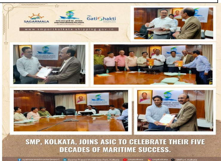
SMP, KOLKATA, JOINS ASIC TO CELEBRATE THEIR FIVE DECADES OF MARITIME SUCCESS.